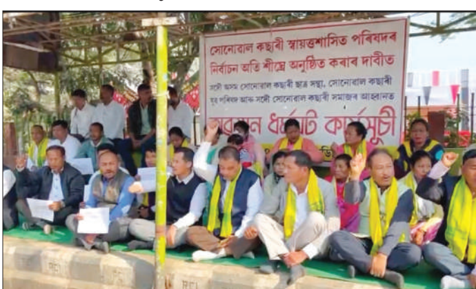
HT Correspondent DIBRUGARH, Jan 9: Various organisations of the Sonowal Kachari community on Friday staged a sit-in demonstration at Chowkidinghee in Dibrugarh, protesting the delay in holding elections to the Sonowal Kachari Autonomous Council. Raising slogans of "No election, no BJP", the agitators said the protest has assumed special signif-

icance as it is being held in the home district of former chief minister Sarbananda Sonowal. The protest was jointly spearheaded by the All Assam Sonowal Kachari Students' Union (AASKSU), the Sonowal Kachari Youth Council (SKYC) and members of the Sonowal Kachari community. Leaders of the organisations alleged that the state government has failed to fulfil its commitments regarding the conduct of the autonomous council elections. They pointed out that as per official notifications, the elections were scheduled to be held in 2024 but were later deferred to February 2025. Despite repeated assurances, the elections have not been conducted so far. The protesters further stated that on November 10, 2025, the Election Commission of India had published the draft electoral roll for the council and invited objections. Subsequently, on November 28, the Additional Chief Secretary of the state's Plains Tribal Welfare Department notified the delimitation of 32 constituencies of the council. Despite these formal steps, the elections are yet to be held, raising what the agitators described as serious doubts and unanswered questions. Expressing strong resentment, the protesters warned that if the Sonowal (CONTD. ON PAGE 2)