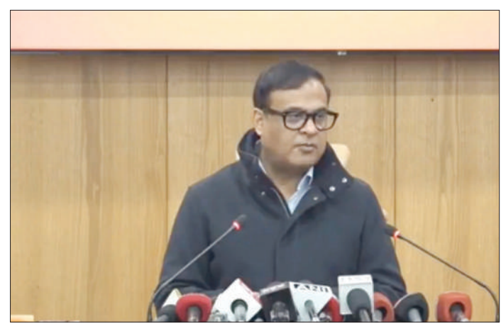
Sarma said. The Chief Minister added that the project would also shorten travel time between Guwahati and Jorhat, improving economic and tourism prospects in the region. Once completed, the corridor is

HT Bureau GUWAHATI, Jan 9: Chief Minister Himanta Biswa Sarma on Friday announced that the Union Cabinet has approved the state government's flagship project to construct an elevated corridor through Kaziranga National Park, a move aimed at protecting wildlife while improving connectivity in Upper Assam. Addressing the reporters here, Sarma said the elevated corridor between Bokakhat and Kaziranga will be built at an estimated cost of over Rs 6,000 crore. He described the project as a landmark intervention that balances infrastructure development with ecological conservation. "The elevated corridor will significantly reduce wildlife mortality caused by vehicular movement and ensure safe passage for animals across the national park,"