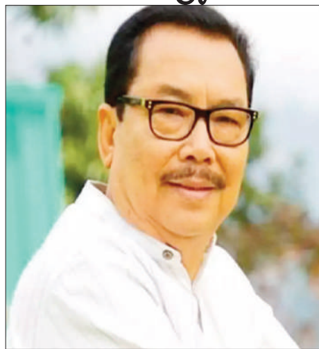
in Arunachal Pradesh," he said.

"The Kamala hydroelectric project reflects our collective commitment to sustainable development, energy security and inclusive growth