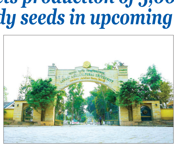
said farmers play a crucial role in the country's development process. He noted that organising such fairs provides farmers with an effective platform to upgrade their skills