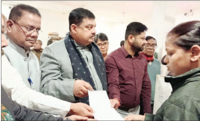
GUWAHATI, Jan 9: Opposition parties in Assam on Friday approached the police and the Chief Electoral Officer (CEO) against the BJP, alleging that it conspired to delete names from the electoral rolls ahead of the assembly polls, a charge rejected by Chief Minister Himanta Biswa Sarma.