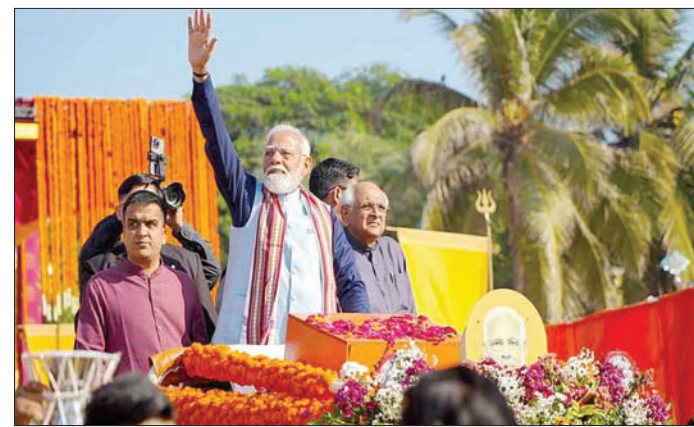
along the parade route.

The crowd, which lined the streets on both sides, cheered and many showered floral petals as the procession moved ahead, while artists performed on different dance forms of India on various stages mounted at regular intervals