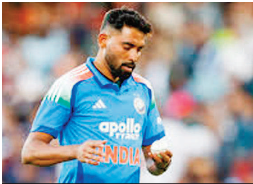
"Shreyas Iyer's availability is subject to fitness clearance from BCCI COE," said the BCCI in a statement.

The other two matches will be played in Rajkot and Indore on January 14 and 18 respectively.