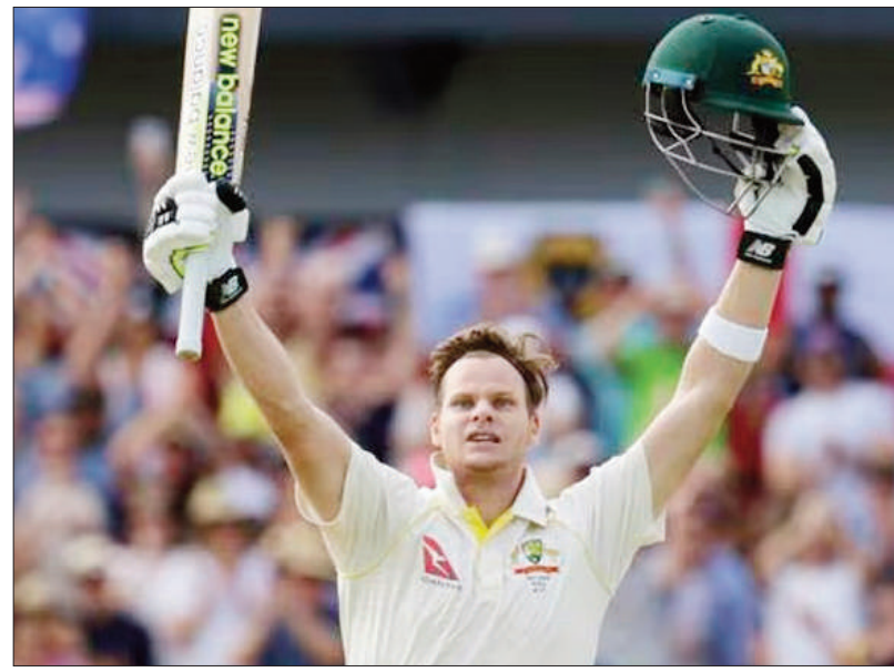
figures from 105 balls, becoming the first Australian opener since Matthew Hayden in 2002-03 to post three centuries in an Ashes series. The 32-year-old left-hander reached the milestone with the 17th boundary of