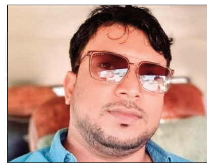
him dead. Police reached the scene immediately after receiving the information and have

Locals rushed him to the Palash Upazila Health Complex, where doctors declared