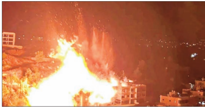
SIDON, Jan 6: Israel's air force struck areas in southern and eastern Lebanon on Monday and early Tuesday, including in the country's third-largest city.

A strike around 1 a.m. Tuesday leveled a three-story commercial building in the southern coastal city of Sidon, a few days before Lebanon's army commander is scheduled to brief the government on its mission of disarming militant group Hezbollah in areas along the border with Israel.