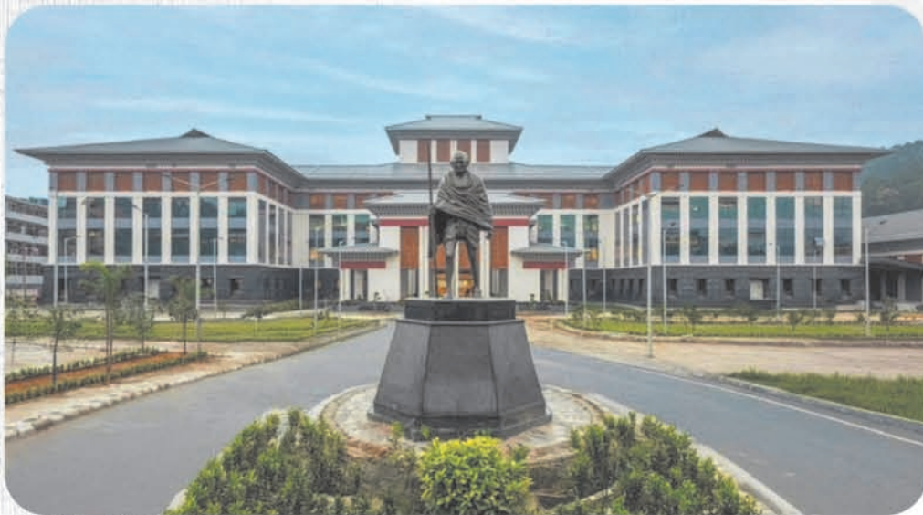
Gauhati High Court, Itanagar Permanent Bench Delivered on 10 August 2025