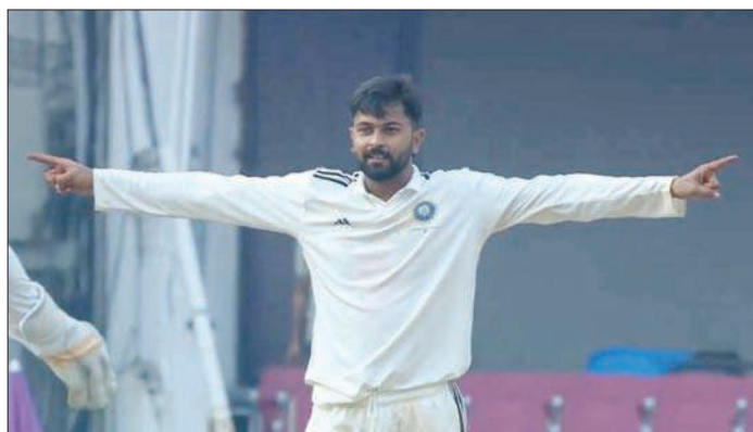
batter suffered a cut on the webbing between his left index and middle fingers.

The absence of injured Karun Nair too hastened the eight-time champions' downfall as the veteran