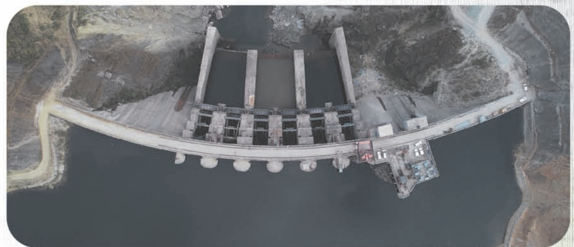
Kameng Hydro Electric Project Delivered November 2022