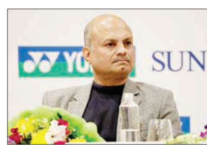
Prakash Padukone Badminton Academy, had said during the India Open.