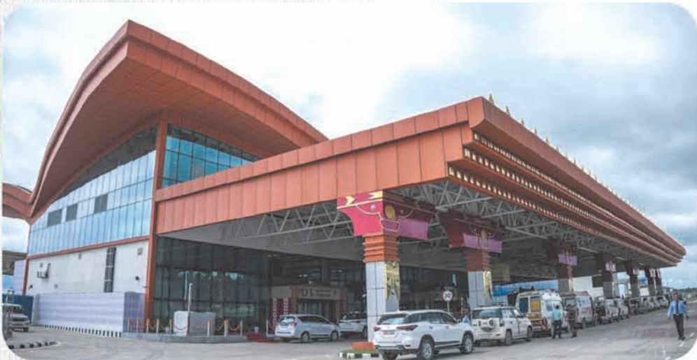
New Terminal at Donyi Polo Airport, Hollongi Delivered on 04 September 2025