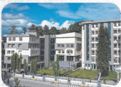
Administrative Training Institute, Naharlagun Delivered on 03 October 2025