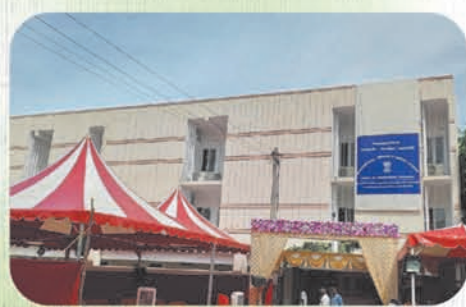
Arunachal Pradesh Patients' Guest House in Vellore inaugurated