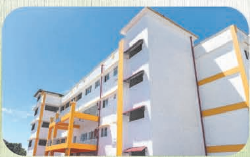
Maternal & Child Health Wing, Namsai Delivered July 2025