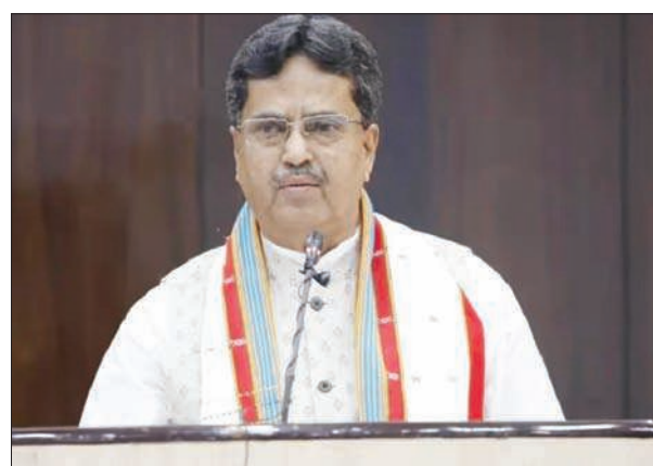
Bishramganj Nagar Panchayat.