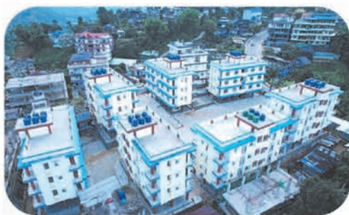
Multi-storey residential complex for Govt staffs Delivered May 2025