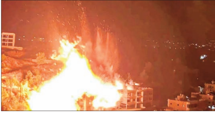
SIDON, Jan 6: Israel's air force struck areas in southern and eastern Lebanon on Monday and early Tuesday, including in the country's third-largest city.

A strike around 1 a.m. Tuesday leveled a three-story commercial building in the southern coastal city of Sidon, a few days before Lebanon's army commander is scheduled to brief the government on its mission of disarming militant group Hezbollah in areas along the border with Israel.