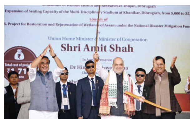
Expansion of Seating Capacity of the Multi-Disciplinary Stadium at Khanikar, Dibrugarh, from 5,000 to 35,000. Launch of S. Project for Restoration and Rejuvenation of Wetlands of Assam under the National Disaster Mitigation Fund.

The people of Dibrugarh will also be now "known as residents of a capital city and