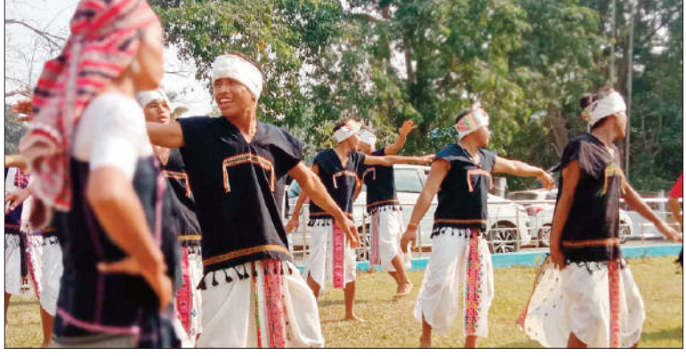
transformation over the years. Under the leadership of the Karbi Cultural Society (KCS), concerted efforts have been made to bring the festival onto public platforms with the aim of preserving indigenous heritage and showcasing Karbi culture on a wider stage. This transition to public celebrations has significantly increased the popularity of Hacha Kekan across both hill

KHERONI, Jan 20: The vibrant cultural tapestry of West Karbi Anglong came alive on Monday night as the Karbi community celebrated Hacha Kekan, the traditional post-harvest festival, at Kheroni Chariali with great enthusiasm and traditional fervour.