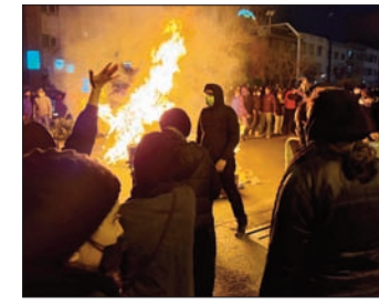
Protest death toll rises

Iranian state TV issues first official death toll from recent protests