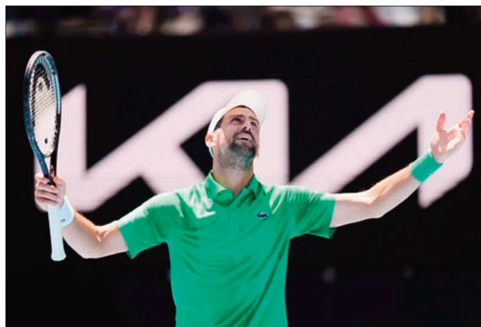
Djokovic into the afternoon session.

Day and night With Sinner facing an Australian wild card, he got the prime time night slot and bumped 10-time Australian Open winner