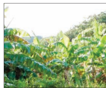
yarn, fabric, and biodegradable paper. Currently, pseudostems are discarded by farmers after collecting bananas due to a lack of facilities for reusing the waste.

"We have 25,000 organic farmers registered with us in the northeast and 5000 in Tripura. They use organic fertilisers to get a better price. At least 20 persons will get direct employment at the CFC," he said.