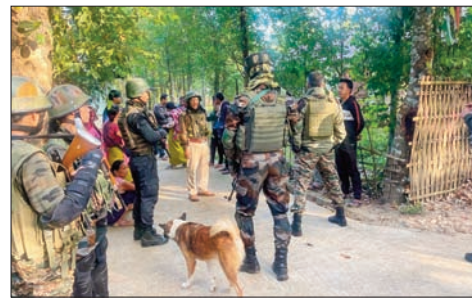
Lines. Over 260 people have been killed and thousands rendered homeless in the hostilities.

Kukis and Meiteis do not venture into each other's areas after the violence broke out in May 2023, leaving the state deeply divided on ethnic