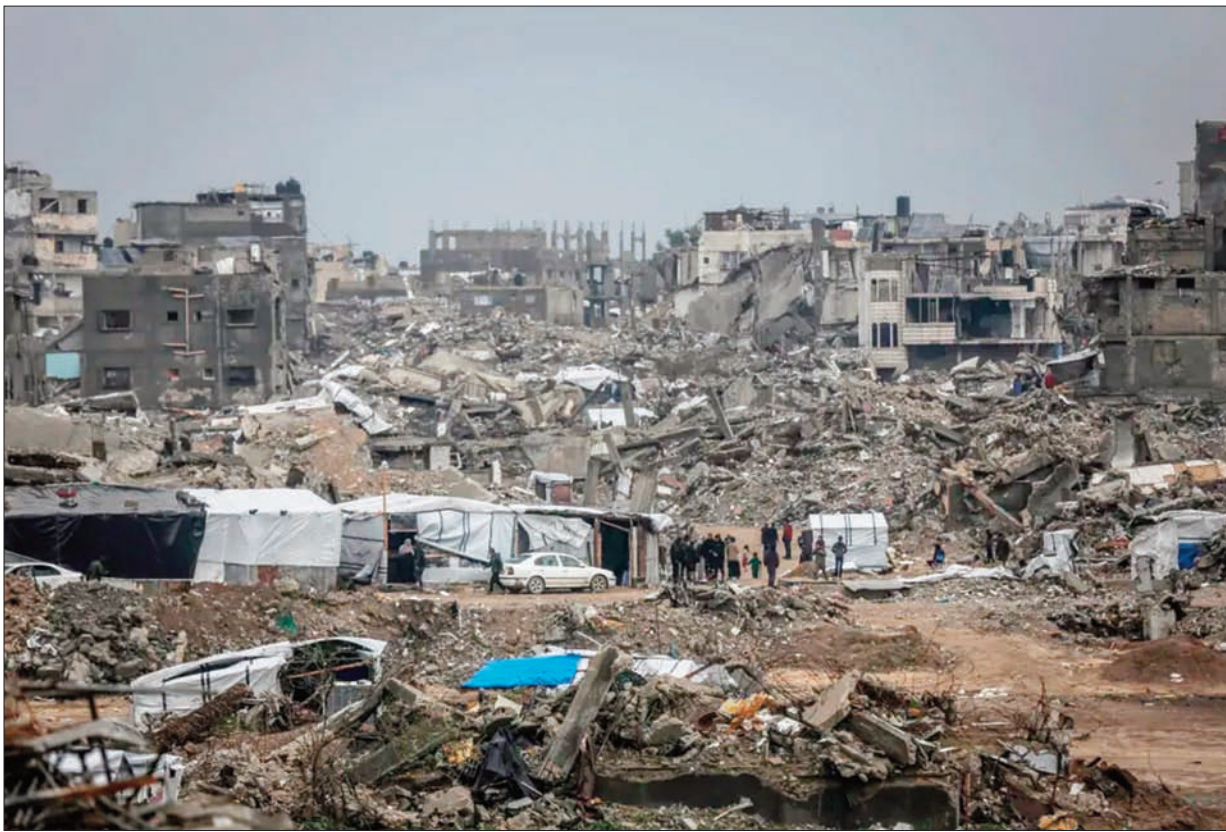
By: Ranjan Solomon

The idea of constituting a “Board of Peace” for Gaa may sound benevolent, even urgent, to those watching the carnage from a distance. It appeals to the liberal imagination: technocrats around a table, former leaders with gravitas, global figures invoking reconciliation, reconstruction, and stability. Yet beneath this humanitarian vocabulary lies a deeply flawed premise. Gaza does not suffer from a deficit of ideas, administrators, or plans. It suffers from occupation, siege, apartheid, and genocide. No board - however well branded - can substitute justice with management. Besides the plan will be carried out by a pre-dominantly set of colonialists - western dominated down to the bone. The formation and, thus the formulae that might emanate from it, will be racially toned and tuned, imperialist, and be tilted in Israel's favour - and the West as a whole. The very fact that Trump has brought a white western-dominated clique suggests that a permanent and just solution