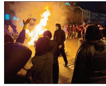
Protest death toll rises

Iranian state TV issues first official death toll from recent protests