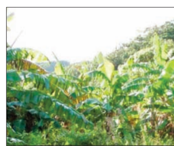
yarn, fabric, and biodegradable paper.

and restricted access in Army zones. The official said prolonged dry weather and lack of snowfall had worsened the situation. Teams from the fire and departments, Army and local volunteers were on the ground, he added. The official said there was no loss of life or property so far as there were no houses, army bunkers or barracks in the area. It may be informed that on January 18, a forest fire at Thambi Dara near Nathula was contained within a day of operations. (PTI)