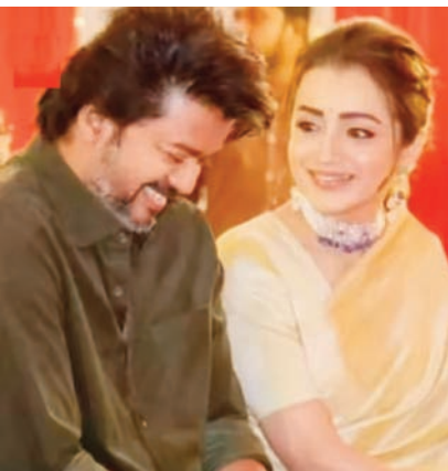
Vetri Kazhagam (TVK), made a personal reference to the actor that was widely circulated on social media.

Vijay and Trisha have starred in a number of Tamil hits, including 'Ghilli'.