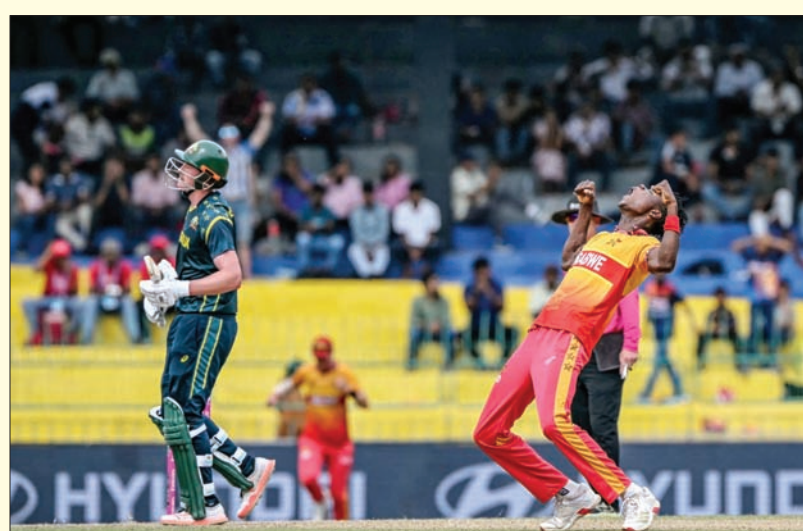
ing a top team like them will be a huge psychological boost for Zimbabwe going into Tuesday's match against Ireland.

While Australia are a depleted side in this tournament marred by injuries, beat-