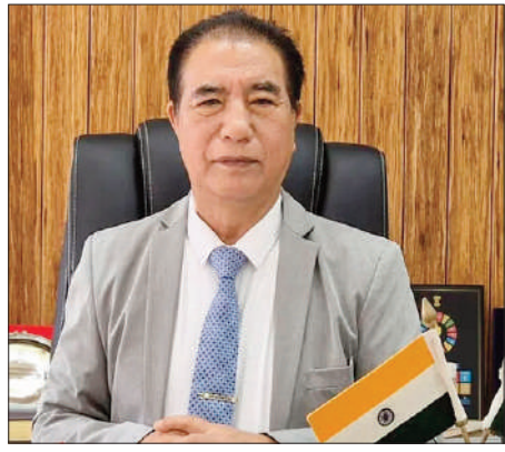
Lalduhoma said the government has recently secured ₹ 803.74 crore loan from the Asian Development Bank (ADB) to strengthen healthcare and enhance implementation of the MUHCS.

The government has launched Operation Jericho, a joint crackdown by the state police, the excise department and Young Mizo Association (YMA), Mizoram's largest civil society organisation, to curb drug trafficking and addiction in September last year.