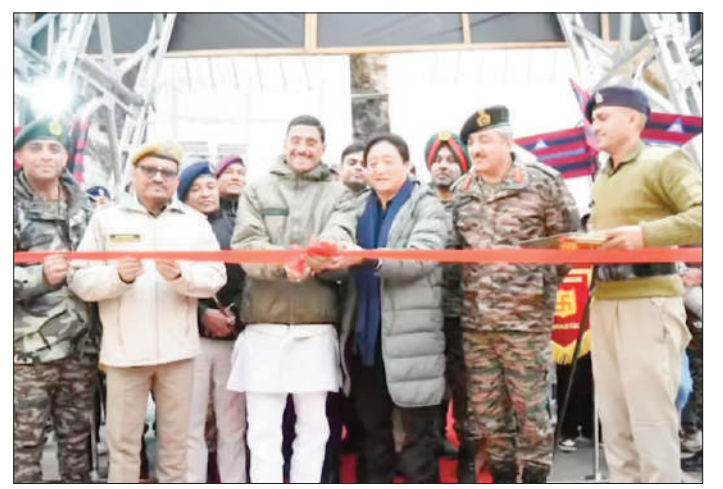
the MoS Defence for visiting North Sikkim and inaugurating the much-awaited bridge.