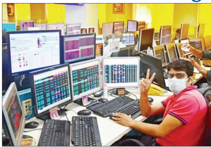
Geojit Investments Ltd. said.