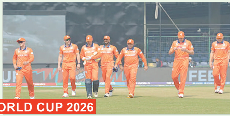
T20 WORLD CUP 2026

a fluent 32, forging a vital stand with Bas de Leede.