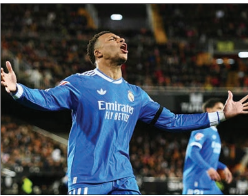
MADRID, Feb 10: Kylian Mbappé's latest impressive scoring run with Real Madrid has brought up comparisons to Cristiano Ronaldo.

After Mbappé scored his 23rd goal in 22 Spanish league games in Madrid's 2-0 win at Valencia on Sunday, coach Álvaro Arbeloa said the France striker could be well on his way to matching the success of Ronaldo at the Spanish powerhouse.