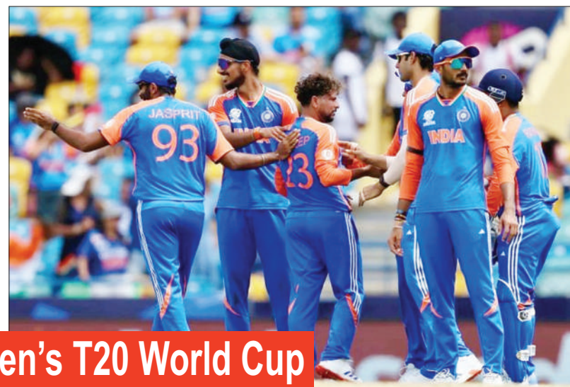
ICC Men's T20 World Cup

Despite the hype associated with this edition's scale of participation, one isn't