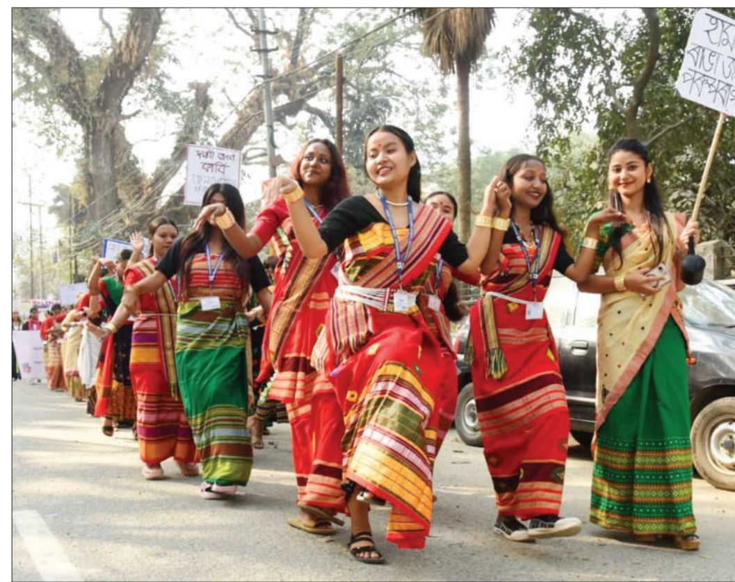
Students of Handique Girls College take part in a Cultural rally during the 'College Week 2026', in Guwahati, on Friday.

The AICC general secretary maintained that people of Assam are not (CONTD. ON PAGE 2)