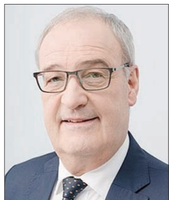
NEW DELHI, Feb 18: Switzerland fully supports India's efforts to democratize artificial intelligence and welcomes the AI Impact summit's focus to ensure that the potential of the critical technologies must benefit every nation, Swiss President Guy Parmelin said on Wednesday.

In an interview to PTI, Parmelin backed cross-border flow of data saying it is crucial to exploit the potential benefits from digital technologies like artificial intelligence but at the same time pitched for a set of principles and rules to protect data sovereignty of nations.