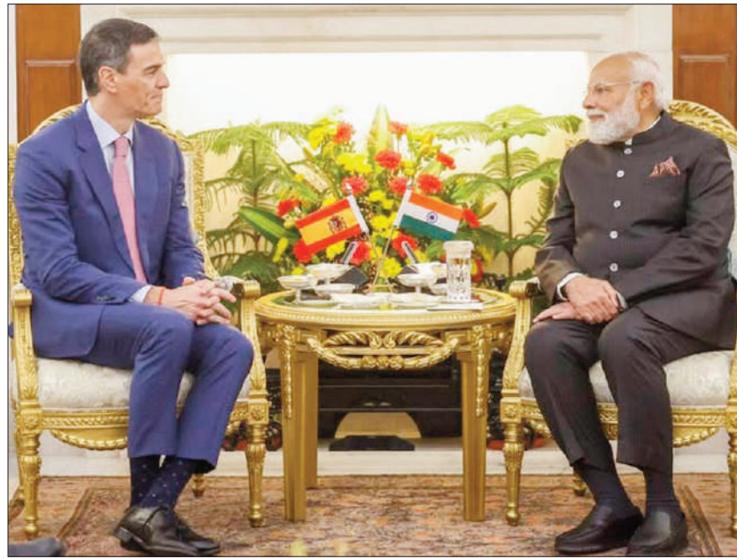
Prime Minister Modi and President Sánchez held bilateral talks and reviewed the entire gamut of India-Spain relations, including trade and investment, technology, infrastructure, climate and renewable energy, defence and security, space, culture, tourism and people-to-people exchanges, the Prime Minister's Office (PMO) said in an official statement.

"I have congratulated him on the organisation of the Summit on the Impact of Artificial Intelligence. We share the need to continue taking steps towards an AI that puts people at the centre," Sánchez said in a post on X in Spanish.