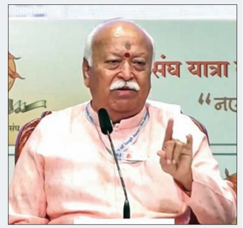
Bhagwat said the RSS believes in exposing corruption and supports anyone fighting against it. "Our volunteers are told to support those who fight corruption. The RSS is in favour of strict laws and legislation against corruption and will support action against corrupt people," he said. He said corruption lies in people's minds and not in the system. "There are people who corrupt the system and some who improve it," he added.

"If an area has a population of 10,000, we try to work there. Once we spread geographically, all classes and communities will be reached. If you look at the top circle of the RSS, most communities have representation," he said.