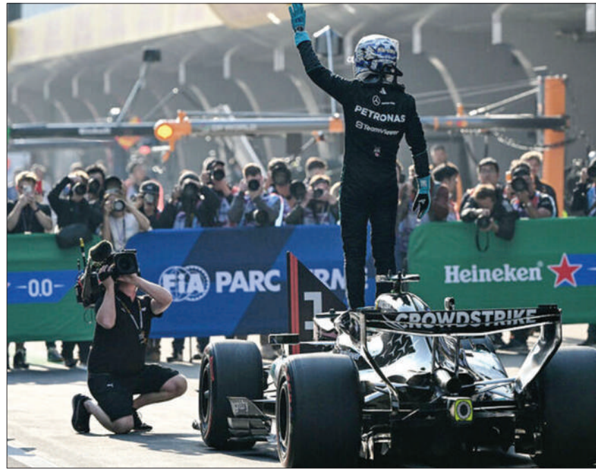
session, as Ferrari failed to find a significant advantage from its unique rear wing which rotates upside-down for more speed on the straights.

Ferrari debuts Macarena Russell and Mercedes led the way in Friday's sole practice