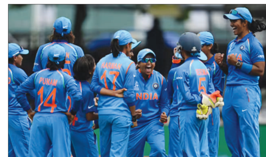
five in 2020. As for career interest, 26 per cent of young women aged 15 to 24 say they have considered a career in sport, up from 16

The study also shows that for every woman who plays cricket, three men play the sport, compared with a ratio of one to