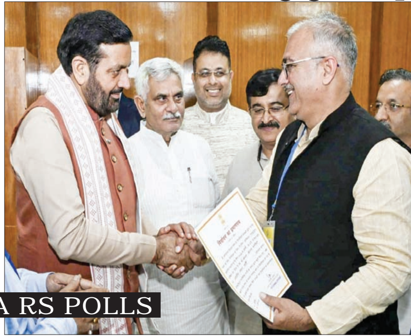
HARYANA RS POLLS

The leader of opposition in the Haryana Assembly, Bhupinder Singh Hooda, told reporters that while he will not take names (of those who cross-voted), "people have un-