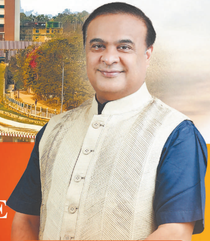
Chief Guest Dr Himanta Biswa Sarma Chief Minister, Assam

Date: 11 March 2026 | Time: 2:30 PM Venue: Diphu Cancer Centre, Old Civil Hospital Road, Diphu, Karbi Anglong