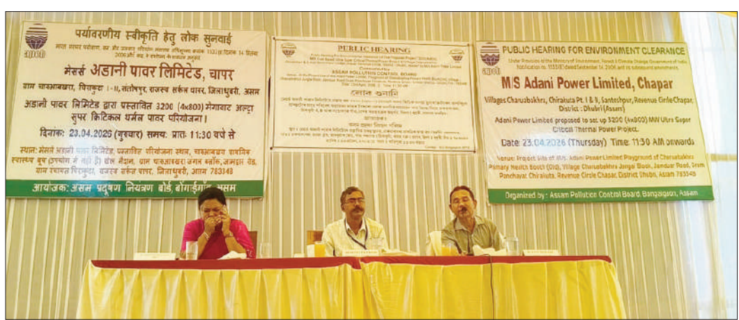
will be set up across Charuabakhra, Chirakuta-I & II and Santoshpur areas under Chapar Revenue Circle. The Assam government has already cleared nearly

HT Correspondent BILASIPARA, April 23: A public hearing on environmental clearance for the proposed 3200 MW (4x800) coal-based ultra supercritical thermal power project of Adani Power Limited was held at Charuabakhra under Chapar Revenue Circle in Dhubri district on Thursday. The hearing was conducted by the Assam Pollution Control Board (APCB) at the project site located at the playground of Charuabakhra Primary Health Booth (Old), under Chirakuta Gaon Panchayat. The programme began at around 11:30 AM and witnessed the participation of a large number of local residents from Charuabakhra, Santoshpur, Chirakuta and adjoining areas. During the hearing, people expressed their views, concerns and suggestions regarding environmental impact, pollution control measures and livelihood issues. Several speakers highlighted the need for proper safeguards to protect the environment and local communities. It may be mentioned that the proposed thermal power project