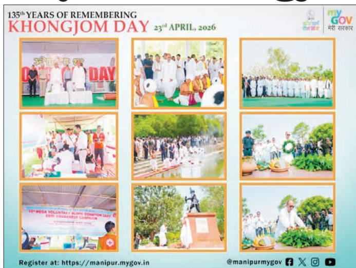
135 th YEARS OF REMEMBERING KHONGJOM DAY 23 rd APRIL, 2026 Register at: https://manipur.mygov.in