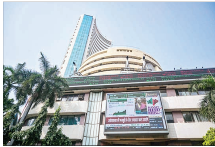
Mahindra & Mahindra, Infosys and HDFC Bank were among the major laggards.