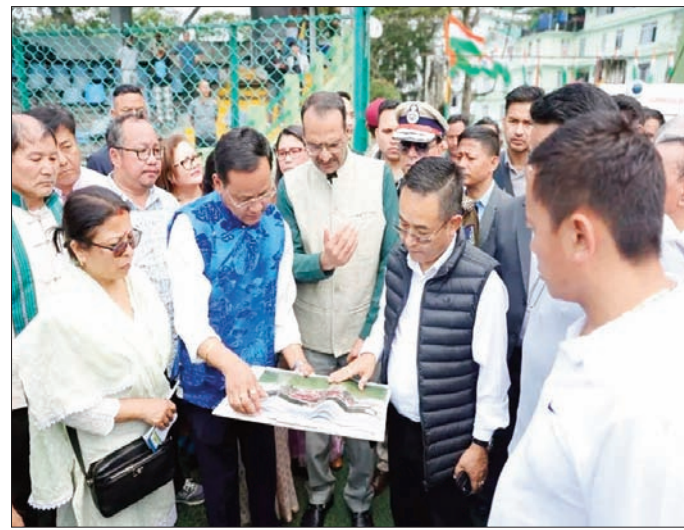
GANGTOK, April 23: Sikkim Chief Minister Prem Singh Tamang on Thursday reviewed the preparations for Prime Minister Narendra Modi's two-day visit

Focus on security, coordination and smooth conduct of events