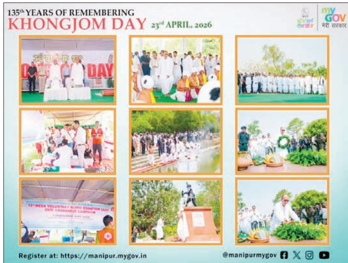
135 th YEARS OF REMEMBERING KHONGJOM DAY 23 rd APRIL, 2026 Register at: https://manipur.mygov.in