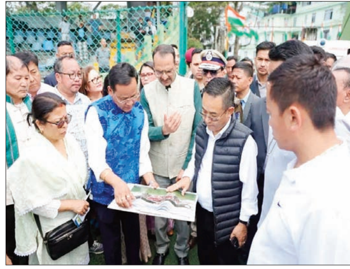
GANGTOK, April 23: Sikkim Chief Minister Prem Singh Tamang on Thursday reviewed the preparations for Prime Minister Narendra Modi's two-day visit

Focus on security, coordination and smooth conduct of events