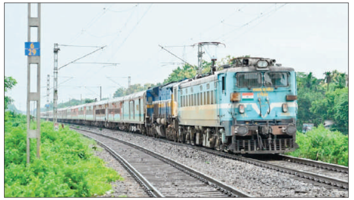
Balurghat-Kolkata) Tebhaga Express, 13053/13054 (Howrah-Radhikapur-Howrah) Kulik Express, 15463/15464 (Balurghat-Haldibari-Balurghat) Intercity Express, 15716 (Ajmer-Kishanganj) Garib Nawaz Express, 15719/15720 (Katihar-Siliguri-Katihar) Intercity Express (via Barsoi), 15710/15709 (New Jalpaiguri-Malda Town-New Jalpaiguri), 13141/13142 (Sealdah-New Alipurduar-Sealdah) Teesta Torsa Express, 75705/75706 (Siliguri-Radhikapur-Siliguri) DEMU Intercity Express and 15721/15722 (New Jalpaiguri-Digha-New Jalpaiguri) Paharia Express along with DEMU passenger and other connecting services. Under the revised schedule, timings at several stations have been advanced to enable faster running and improved punctuality. For instance, at Gangarampur, timings have been preponed from 11:18/11:20 hours to 11:15/11:17 hours, while at Buniadpur, timings have been advanced from 11:05/11:07 hours to 10:58/11:00 hours. Similar speed-up adjustments have been implemented across multiple sections, resulting in reduced travel time, while timings at some stations remain unchanged to ensure minimal inconvenience. The details of stoppages and timings of these trains are available on the IRCTC website and are also being notified in various newspapers and social media platforms of N.F. Railway. Passengers are requested to verify the details before undertaking their journey. NFR remains committed to safe, efficient, and passenger-friendly services, continually enhancing the travel experience across the region.

HT Bureau GUWAHATI, April 23: Northeast Frontier Railway (NFR) has undertaken a comprehensive revision of the timings of several Mail/Express and passenger trains across its network with the objective of improving punctuality, enhancing operational efficiency and ensuring faster services for passengers. The revised timings will be implemented from April 27, 2026 for most services, while certain trains will adopt the new schedule from April 24 and April 28, 2026. The revision covers major divisions including Katihar, Alipurduar, Rangiya, Lumding and Tinsukia and includes a wide range of important train services. Several trains such as Farakka Express, Teesta Torsa Express, Kulik Express, Garib Nawaz Express, Paharia Express, Intercity Express and DEMU passenger services have undergone changes in their arrival and departure timings at multiple stations. These adjustments have been undertaken to enhance operational efficiency, improve punctuality and strengthen connectivity across different sections. Among the major trains affected by the revision are 15743/15744 (Balurghat-Bhatinda-Balurghat) and 15733/15734 (Balurghat-Bhatinda-Balurghat) Farakka Express, 13063/13064 (Howrah-Balurghat-Howrah) Express, 13161/13162 (Kolkata-