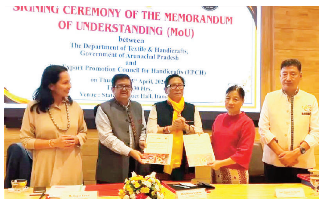
Arunachal Pradesh's handicrafts and market access.

Dukuma expressed confidence that the partnership would help empower artisans and promote