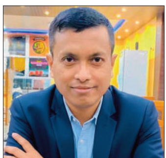
AUTHOR By: Satyabrata Borah

The world today feels like a ship navigating through a heavy fog where the waves of change are both constant and unpredictable. In this shifting landscape, the partnership between India and South Korea has emerged as a steady anchor for both nations. Looking at the map, these two countries might seem far apart, separated by vast stretches of sea and land, but their current connection is deeper than simple geography. They find themselves at a unique crossroads in 2026, where shared democratic values and a mutual desire for stability are drawing them closer than ever before. This bond is no longer just about selling cars or electronics; it is about two major Asian powers realizing they are much stronger when they face the world together.