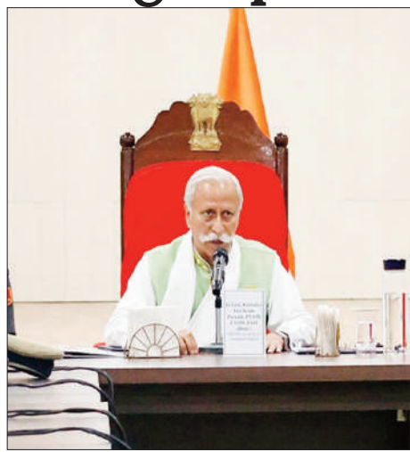
resource distribution and strengthening governance.

Describing the process as a civic responsibility, Parnaik urged citizens to participate with sincerity and awareness, stating that the exercise goes beyond data collection and plays a vital role in assessing needs, ensuring equitable