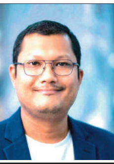
DEGREE OF THOUGHT

Reflecting on World Malaria Day also forces us to confront the political will required to sustain this fight. Funding for malaria programs often fluctuates based on the political climate of donor nations. This inconsistency is dangerous. To truly