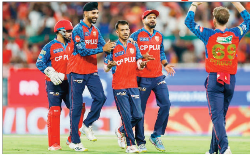
have one eye on the next season after losing five of their last six games, pushing them towards the bottom of the table.

Delhi Capitals, on the other hand, already