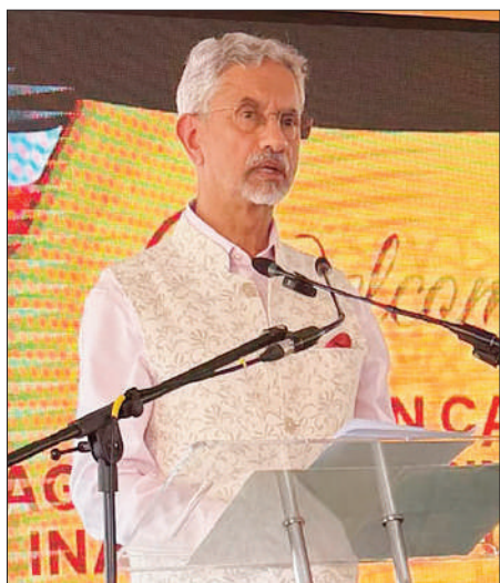
Jaishankar handed over the first batch of 2,000 laptops to selected schoolchildren and inaugurated an agro-processing facility for which machinery worth USD 1 million was provided by India last year.

"A total of 8 MoUs were signed between the two sides in the areas of tourism, solarisation of T&T's Ministry of Foreign and CARICOM Affairs building, vector control, infrastructure upgrade of Nelson Island where the Indian immigrants were stayed initially and for setting up of an Indian Chair on Ayurveda at the Uni-