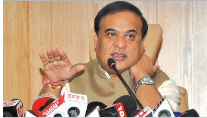
The Chief Minister added that the government now has greater administrative experience and confidence after implementing several welfare schemes, infrastructure projects, and investment initiatives over the last few years.

to accelerate Assam's development," the Chief Minister said. The BJP-led NDA registered a commanding victory in the Assembly elections, decimating the opposition parties and retaining power in the northeastern state. Sarma said the government's future roadmap would be broader and more ambitious compared to the commitments made during the 2021 Assembly elections, which were held in the shadow of the Covid-19 pandemic. "In 2021, when we prepared our election manifesto, the Covid crisis was before us. Because of that situation, many of our commitments were limited in nature. This time, we are preparing a much larger vision for Assam's growth," he said.