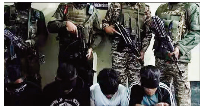
"The role of the apprehended individuals in the abduction of six persons is suspected and will be ascertained during the course of investigation," a police statement said, adding that further investigation is underway.

The arrested persons were identified as Thangkhomang Khongsai (51), Seikholet Khongsai (40), Lunminthang Dimngel (27) and Kangmoul Khongsai (30). Police said the four are suspected to be active members of armed village volunteer groups operating in the district and may have been involved in anti-social activities such as extortion, criminal intimidation, and illegal possession of arms and ammunition.