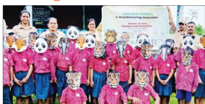
at the Bansbari range on the occasion of Children's Day with a focus on involving students and youth in environmental awareness activities. "Since its launch, the programme has aimed at promoting understanding of the ecological importance of the Manas landscape