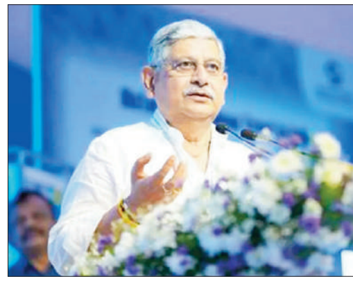
AIZAWL, May 26: Union Minister Rajiv Ranjan Singh has announced a series of initiatives to strengthen Mizoram's cooperative dairy sector.

During his visit to the Mizoram Milk Producers' Cooperative Union Limited (MULCO) dairy at Thuampui in Aizawl on Monday, Singh, the Union Minister for Fisheries, Animal Husbandry and Dairying and Panchayati Raj, said that milk production in Mizoram remains insufficient to meet local demand and urged local farmers and officials to work with renewed commitment.