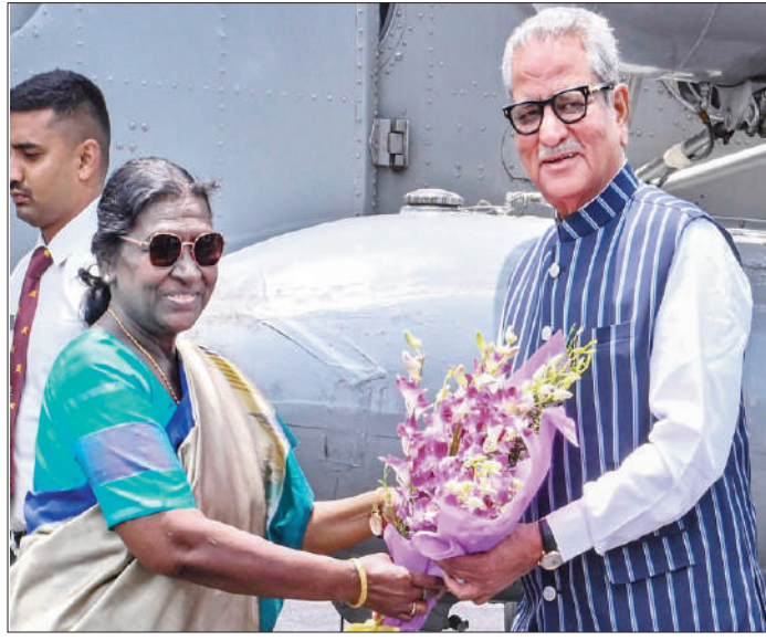
GANGTOK, May 26: President Droupadi Murmu arrived in Sikkim on Tuesday on a three-day visit, during which she will visit the India-China border, of-

officials said. She landed at Libing Helipad around 12 and was received by Governor Om Prakash Mathur and Chief Minister Prem Singh