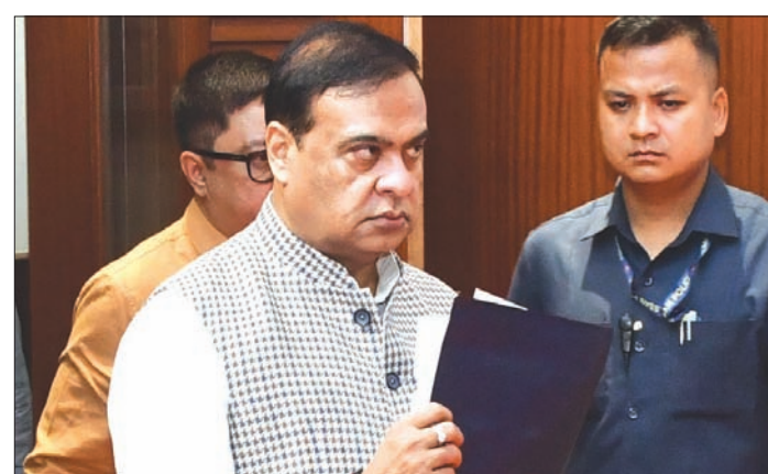
later returned to the House before the resolution was taken up. Participating in the discussion, Sarma said the women's reservation bill was moved in Parliament several times over the past decades, and though the Congress had been in power, it had not en-