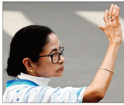
served a ticket. Internal sabotage played a major role in our defeat."

He also blamed I-PAC-driven electoral management and ticket distribution strategies, saying, "Every gram panchayat member believed he de-