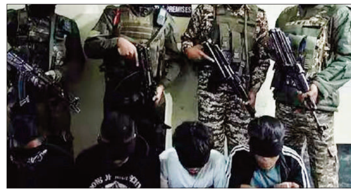
"The role of the apprehended individuals in the abduction of six persons is suspected and will be ascertained during the course of investigation," a police statement said, adding that further investigation is underway.

Police said the four are suspected to be active members of armed village volunteer groups operating in the district and may have been involved in anti-social activities such as extortion, criminal intimidation, and illegal possession of arms and ammunition.