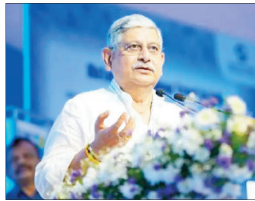
AIZAWL, May 26: Union Minister Rajiv Ranjan Singh has announced a series of initiatives to strengthen Mizoram's cooperative dairy sector.

During his visit to the Mizoram Milk Producers' Cooperative Union Limited (MULCO) dairy at Thuampui in Aizawl on Monday, Singh, the Union Minister for Fisheries, Animal Husbandry and Dairying and Panchayati Raj, said that milk production in Mizoram remains insufficient to meet local demand and urged local farmers and officials to work with renewed commitment.