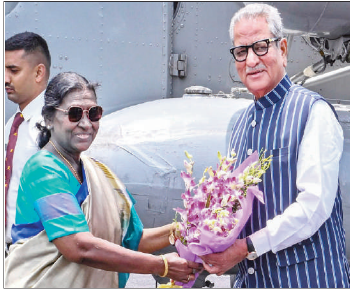
GANGTOK, May 26: President Droupadi Murmu arrived in Sikkim on Tuesday on a three-day visit, during which she will visit the India-China border, of-

officials said. She landed at Libing Helipad around 12 and was received by Governor Om Prakash Mathur and Chief Minister Prem Singh