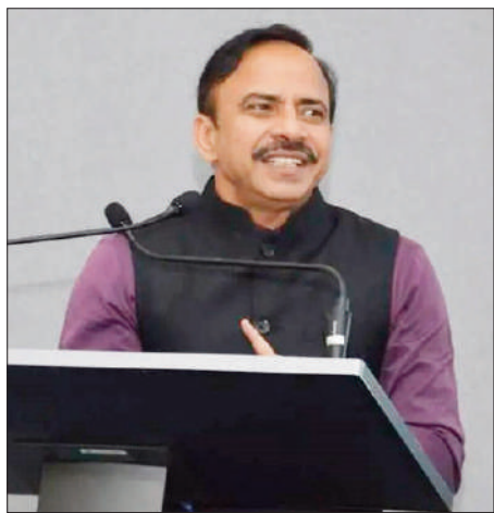
'Mission Shakti'. He assessed the progress of the project on site.

Following this, the Special Secretary visited the State Women and Children's Home campus in Shivanagar to inspect 'Sakhi Niwas', a hostel being constructed for working women under