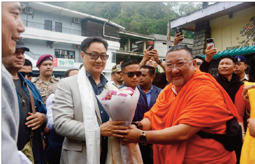
GANGTOK, April 30: Union Minister for Parliamentary and Minority Affairs Kiren Rijiju on Thursday arrived in Sikkim on a three-day visit during which he is scheduled to hold meetings with

state leaders and review ongoing projects, officials said.