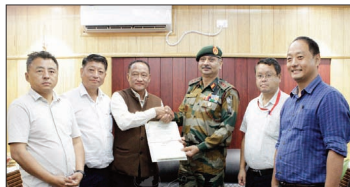
HT Correspondent DIMAPUR, May 9: Assam Rifles on Friday handed over 18.8 acres of land, presently under occupation of Assam Rifles Training Centre and School (ARTC&S), 3rd Mile, Chumoukedima, to the Airport Authority of India (AAI) for the