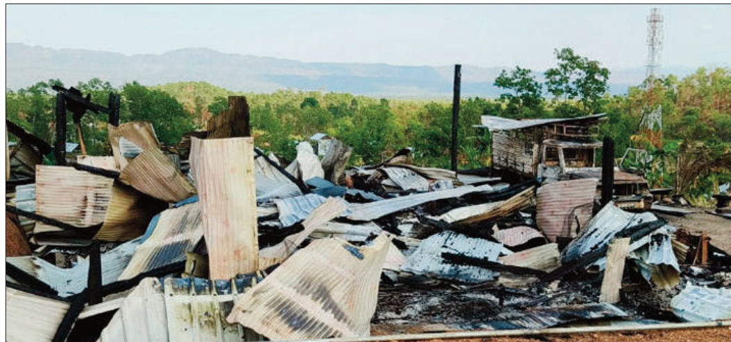
IMPHAL, May 9: The All Naga Students' Association, Manipur (ANSAM) strongly condemned what it described as "barbaric cross-border terrorist aggression" perpetrated by nomadic Kuki armed militants under Suspension of Operation (SoO) and the foreign Burma-based People's Defence Force (PDF), jointly with the Kuki National Army-Burma (KNA-B) and supported by Kuki refugees, against Naga villages along the Indo-Myanmar frontier in the Kamjong area of Ukhrul district.

The student body said the "coordinated attacks" have been continuing on Naga villages including TM Kasom, Ringui, Thoyee, Sharkaphung, S Laho and Sinakeithei. It alleged that a large-scale armed "invasion" was carried out in the early hours of May 7, 2026, at Z Choro, Namlee, Wanglee Market and Ashang Khullen (KAKA) in which houses were set on fire.