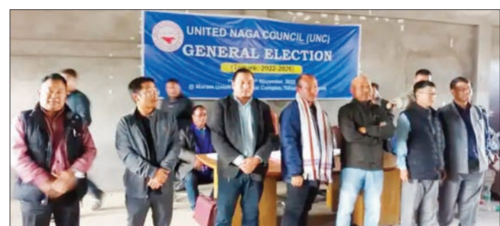
IMPHAL, May 9: Alleging that Kuki militants based in Myanmar were responsible for attacks on Naga villages on May 7, the United Naga Council (UNC) has demanded "immediate and decisive military action by the Government of India to neutralise the foreign aggressors and restore the sanctity of the international Indo-Myanmar border".

According to the UNC, at around 4 AM on May 7, more than one hundred "heavily armed terrorists" breached the international Indo-Myanmar border from Myanmar and carried out a premeditated assault on the Naga villages of Namlee, Wanglee, Ashang Khullen (KAKA) and Z Choro.