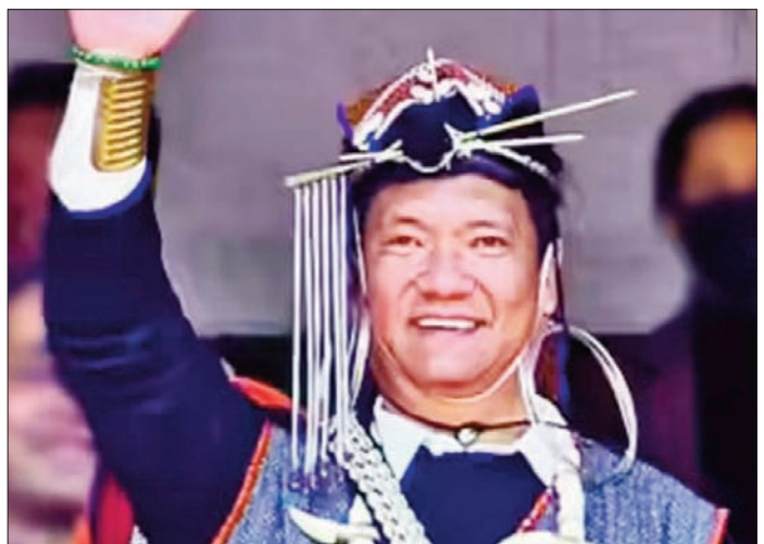
"A new chapter for West Bengal is about to begin. One that will be written with the ink of development, peace and harmony."

Adhikari and five other BJP MLAs took the oath at the iconic Brigade Parade Grounds in Kolkata in the presence of Modi, Union Home Minister Amit Shah, the BJP's central leadership and chief ministers of NDA-ruled states.