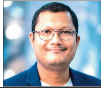
DEGREE OF THOUGHT By: Himangshu Ranjan Bhuyan

The most striking and decisive aspect of this election was the unprecedented awareness and unified support of women voters. Traditionally, Assam's social structure followed an unwritten rule where the women of a family voted for the same party supported by the male head of the household. But in the recently concluded Assembly election, this old perception changed completely. Most of the welfare schemes introduced by the ruling party were centered around women. The system of sending government funds directly into the bank accounts of women as heads of households not only made them financially self-reliant, but also gave them a new sense of dignity and self-respect. Alongside this, the massive network of women created through self-help groups in rural areas transformed into an impregnable fortress during the election. From waiving small loans for women to encouraging them to become entrepreneurs, the steps taken by the government left a deep impact on