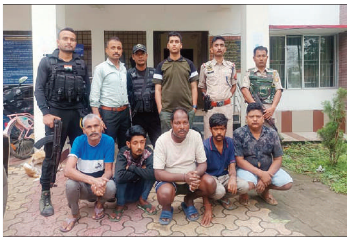
As a case (No 44/2026) under sections 61(2)/112/143(1)/318(4) BNS was registered at Margherita Police Station. All four accused have been sent to judicial custody.

According to investigators, the accused were allegedly attempting to take a 35-year-old man identi-