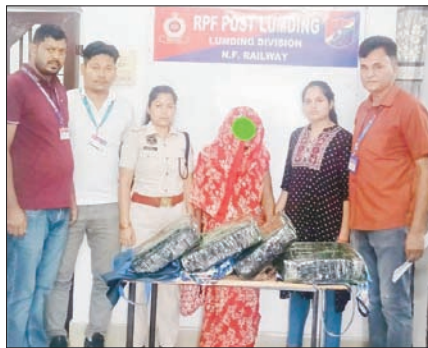
incidents on running trains and apprehended 16 illegal immigrants during the month.

As part of its passenger safety initiatives, RPF/NFR apprehended 28 persons involved in theft of passenger belongings and recovered stolen items, including 44 mobile phones worth over ₹ 6.19 lakh. The force also arrested three persons involved in stone-pelting