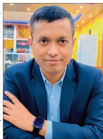
AUTHOR By: Satyabrata Borah

In an effort to prevent this outcome, India made a proactive offer in 2024 to provide its own technical and conservation assistance for the Teesta basin. This was a clear attempt to provide Dhaka with an alternative to Chinese involvement. By offering to help manage the river, India hoped to address Bangladesh's water security needs while keeping the project within the sphere of bilateral cooperation.