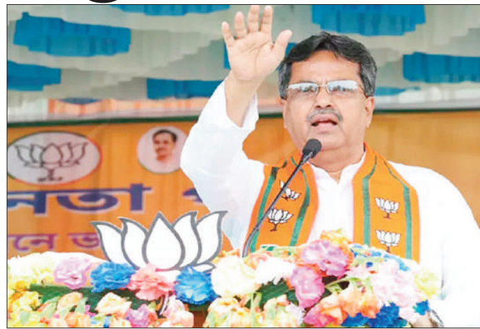
government in Assam on May 12." He said the BJP's streak of wins in states under the leadership of Prime Minister Narendra Modi has special significance in the country's political spectrum.