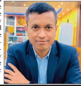
DEGREE OF THOUGHT