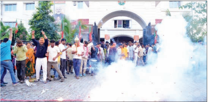
on Monday. While the BJP won 81 seats till 8.30 pm, its allies -- the Bodo Peoples' Front (BPF) and the Asom Gana Parishad (AGP) -- bagged 10 constituencies each. The BJP was leading in one seat. Chief Minister Himanta Biswa Sarma won the Jalukbari constituency for the sixth consecutive term, defeating Congress candidate Bidisha Neog by 89,434 votes.