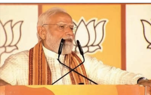
NEW DELHI, May 4: As the BJP swept the assembly elections in West Bengal for the first time, Prime Minister Narendra Modi on Monday said the state has been finally freed from fear and that it is a time for change, not revenge, as he appealed to all parties to shun the culture of political violence and focus on the future of the state. Addressing the jubilant party workers at the BJP headquarters after the win in assembly elections in West Bengal, Assam and Puducherry, Modi said the Congress, TMC and others have been punished se-

verely for opposing the recent women's reservation bill. He asserted that the Samajwadi Party will also face the wrath of women very soon, in an apparent reference to the 2027 assembly elections in Uttar Pradesh.