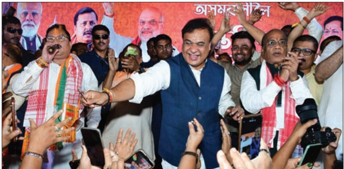
GUWAHATI, May 4: The ruling NDA is set to form the government in Assam for the third time in a row after securing a two-thirds majority, with the alliance winning 101 seats in the 126-member assembly