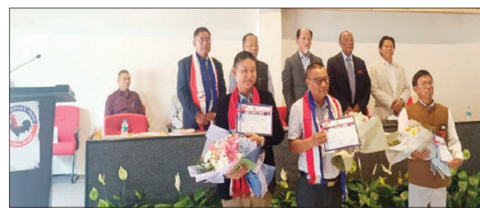
uphold Naga identity and rights,"

"The party is proud that generations of prominent and legendary Naga leaders have served the people through the NPF, and the party has made countless sacrifices to