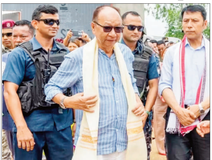
homeless in ethnic violence between Meiteis and Kuki-Zo groups since May 2023.

More than 260 people have been killed and thousands rendered