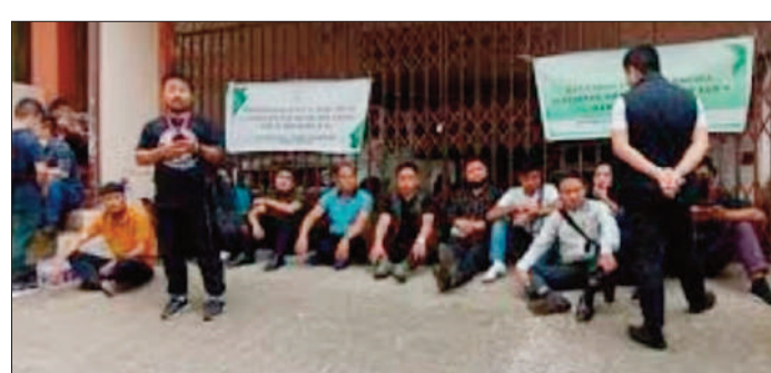
tourism director on May 13.

However, on May 15, the government cancelled the order and decided that she would continue only as OSD after the MZP met Lalduhoma and urged him to rescind her re-engagement as