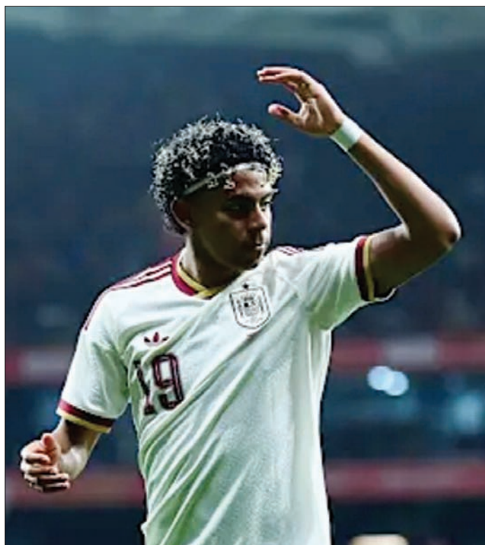
matches against Iraq on June 4 and Peru on June 9.

Spain's preparations will begin on Saturday. It plays warmup