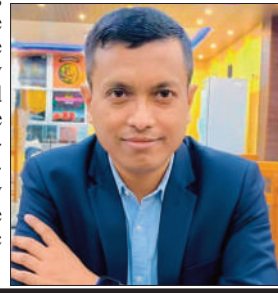
DEGREE OF THOUGHT By: Satyabrata Borah

The sense of security and the promise of a predictable future outweighed any grievances that might have been expected after multiple terms in office.