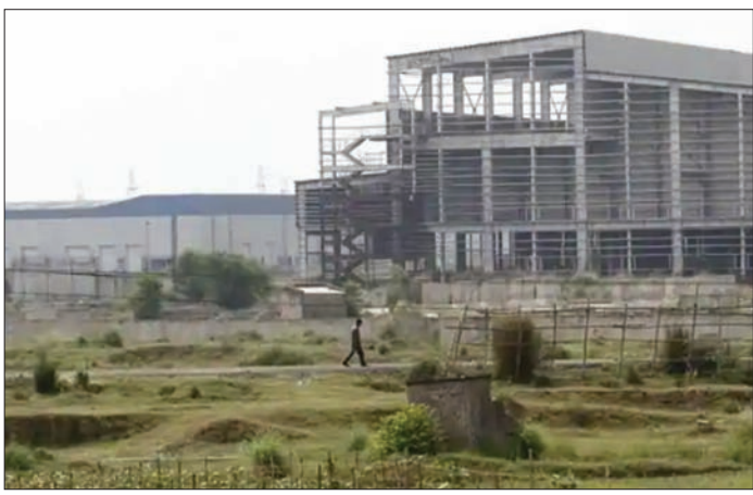
Bengal's image among investors.

He stressed the need for robust and transparent governance, progressive business-friendly policies, stable labour relations and immediate measures to improve