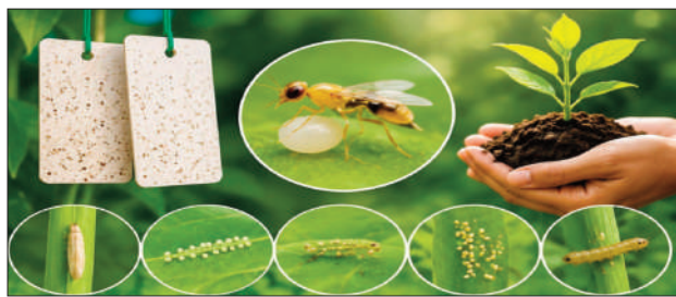
By: Mowsam Hazarika

In the face of rising concerns over excessive pesticide use, environmental degradation, and increasing resistance among crop pests, sustainable alternatives are becoming essential for modern agriculture. One such effective and nature-based solution is the use of Tricho Cards—small cards carrying beneficial insects that offer big protection to crops.