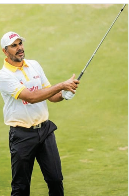
days ensured that India remained represented in the upper half of the leaderboard, even as sev-

The week, however, highlighted the difficulty of the Moroccan layout, with seven other Indian players failing to make the cut after the opening two rounds. Bhullar's consistency over four