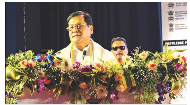
Union Minister for Ports, Shipping and Waterways Sarbananda Sonowal addressing the North-East India Infrastructure Summit and Exhibition 2026 in Shillong on Monday.

"From frontier region to economic growth hub, Prime Minister Narendra Modi has led the Northeast's transformation and it is one of India's biggest success stories," he said. The Minister said the Northeast, once seen mainly for geographical remoteness, is now