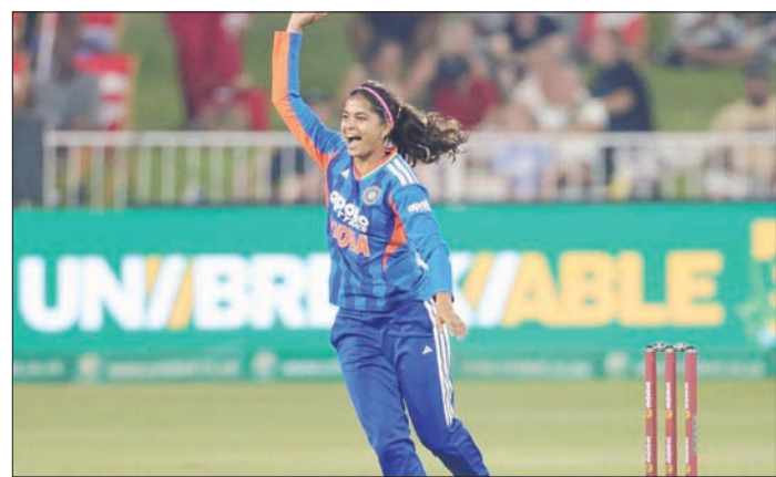
state team or for India. It's amazing to bowl under pressure because that's what I love doing, and it's something I've successfully done in the past.

"I've always enjoyed bowling in the powerplay, whether it's for my