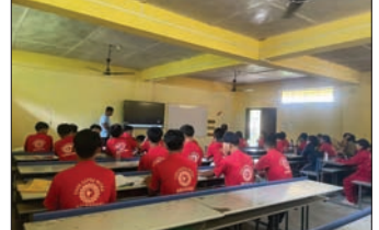
and esprit de corps.

ITANAGAR, June 15: The 1 Arunachal Pradesh Battalion National Cadet Corps (1 AP Bn NCC), under the aegis of NCC Group Headquarters Tezpur, has commenced its Combined Annual Training Camp (CATC-47) cum Inter-Battalion Selection Camp for the Cultural Team for the Pre-Republic Day Camp 2027 at Rajiv Gandhi Government Polytechnic College (RGGPC), Itanagar.