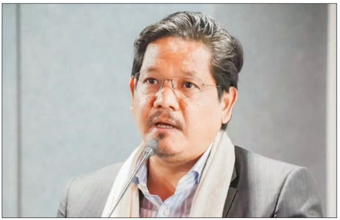
ago," Sangma said in his address.

SHILLONG, June 15: The northeast region is "daring to dream" in shaping its growth story, Meghalaya Chief Minister Conrad Sangma said here on Monday and announced that in the next few years, eight new five-star hotels are set to be opened in his state.