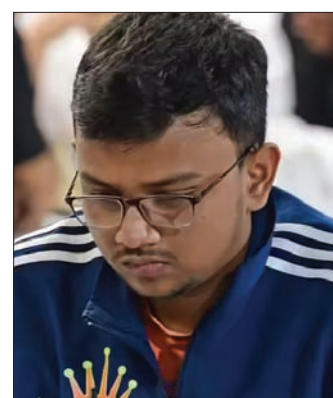
Among the players already confirmed for the ENC 2026 are some of the biggest names in world chess, including Norwegian superstar Magnus Carlsen, Poland's Jan Krzysztof Duda, France's Alireza Firouzja, and the United States' Hikaru Nakamura.

Of the 128 participants, 64 players received direct invitations through the official CCT rankings, ensuring representation from 64 different countries and territories.