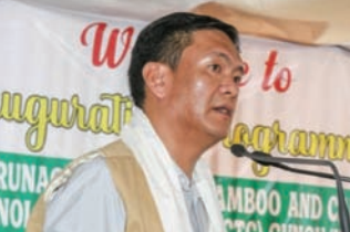
He credited Prime Minister Narendra Modi for reforms that removed bamboo from the category of trees under forest regulations, making its cultivation and commercial use easier.

Highlighting the expanding industrial applications of bamboo, the Khandu said it is no longer confined to traditional handicrafts but is now being used in furniture, construction materials, textiles, biofuel and even aviation fuel.