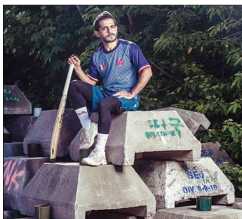
artist to a broader audience while rubbing shoulders with game's greats while he gearing up to represent Acel United Brussels. In Brussels franchise, he will have former Proteas great Mark Boucher as the head coach and a mentor with whom his thoughts align. As Boucher speaks about the future of associate cricket, he keeps returning to one example. Afghanistan. "The moment players started getting opportuni-