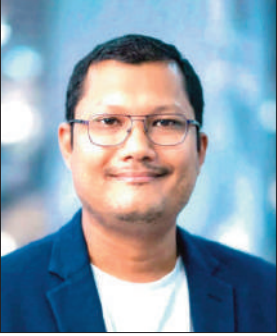
DEGREE OF THOUGHT By: Himangshu Ranjan Bhuyan

A crucial aspect of Assam's green economy lies in the transformation of its traditional industries into sustainable engines of growth. Tea, agriculture, forestry, fisheries, handloom, and tourism have always formed the backbone of the state's economy, yet each of these sectors now faces unprecedented environmental pressures. Climate variability has altered rainfall patterns, prolonged dry spells have affected tea production, floods continue to damage agricultural land, while changing consumer preferences in global mar-