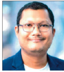
DEGREE OF THOUGHT By: Himangshu Ranjan Bhuyan

The 2026 Assam Legislative Assembly election has emerged as a defining moment in the state's political history. More than a contest between parties, it revealed a significant transformation in voter behaviour and political priorities.