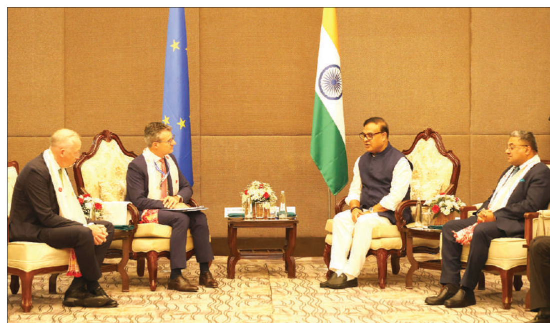
Investors look around the world 'in different geographies where there are opportunities, and it is evident that there are certain distinct advantages that Assam has', he said.