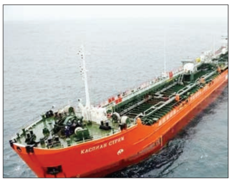
The Paradip refinery on Odisha's east coast also unloaded its highest volume of Russian crude in two years, underscoring the continued attractiveness of discounted Russian barrels for Indian refiners despite evolving geopolitical and sanctions-related pressures.

Russian crude deliveries to New Mangalore rose 13 per cent month-on-month in May, while imports at Visakhapatnam jumped 42 per cent, it said.