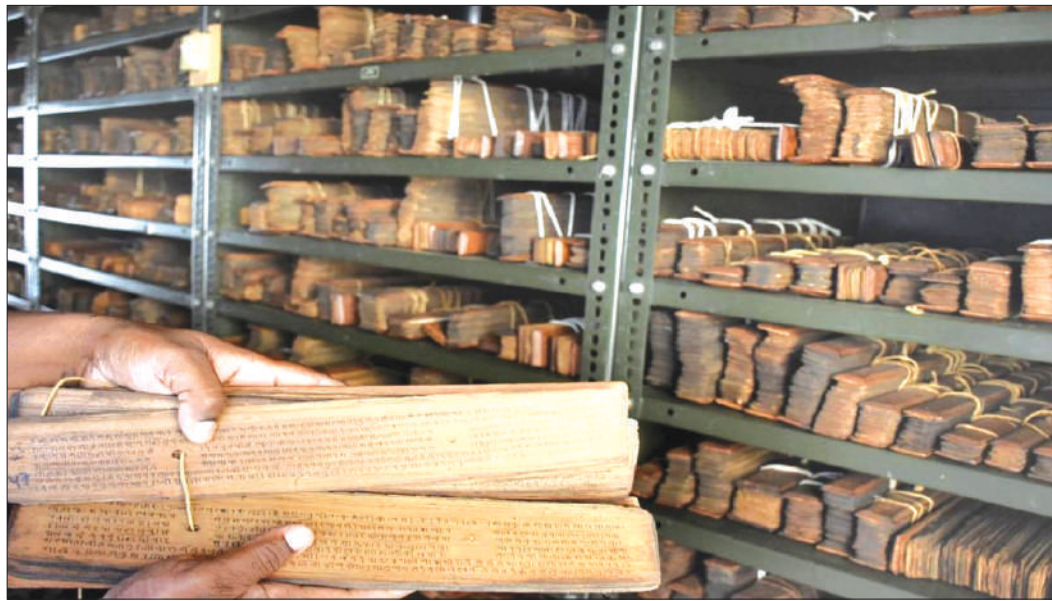
ministration is considering contacting experts from the Institute of Tai Studies and Research (ITSAR) to decode the two rare Tai manuscripts in the near future as well as including the treasure in the Central government's 'Gyan Bharatam' scheme.

"The District Museum is a treasure trove of rich cultural and archaeological heritage. It houses a collection of manuscripts dating back to the Middle Ages, some of which are yet to be completely decoded," Karbi Anglong district commissioner Aranyak Saikia told PTI. It is believed that these manuscripts hold deep insights into the