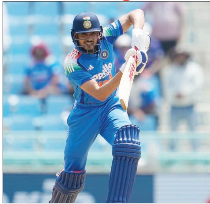
captain was timing the ball sweetly and appeared set for a big score before

Rohit, meanwhile, looked in fine touch and produced glimpses of his vintage best. The former