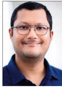
DEGREE OF THOUGHT By: Himangshu Ranjan Bhuyan

essential foundation upon which the state's overall economic strength must ultimately rest. Agriculture therefore requires a comprehensive transformation that extends far beyond increasing crop production. The structural weaknesses that have constrained the sector for decades demand systematic reforms rather than temporary interventions. A large proportion of farmers in Assam cultivate very small and fragmented plots, making mechanisation expensive and often impractical. Dependence on monsoon rainfall continues to expose agriculture to seasonal uncertainties, while irrigation infrastructure remains inadequate across many regions. The widespread use of traditional cultivation methods, limited access to quality seeds, insufficient scientific extension services, and inconsis-