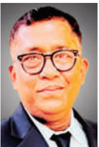
AUTHOR By: Mowsam Hazarika

These are incredibly sensitive questions that cannot be resolved through political rhetoric or emotional appeals. They require hard, undeniable statistical proof that can withstand judicial scrutiny. If the state is going to embark on the controversial path of counting caste, it owes it to the citizens to ensure the job is done with scientific precision. An open-ended, chaotic collection method fails to serve the cause of social justice and only succeeds in muddying the waters of public policy. The current pre-test offers a vital window of opportunity for the administration to course-correct, choosing structured technological control over administrative chaos.