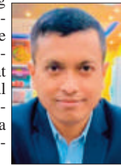
AUTHOR By: Satyabrata Borah