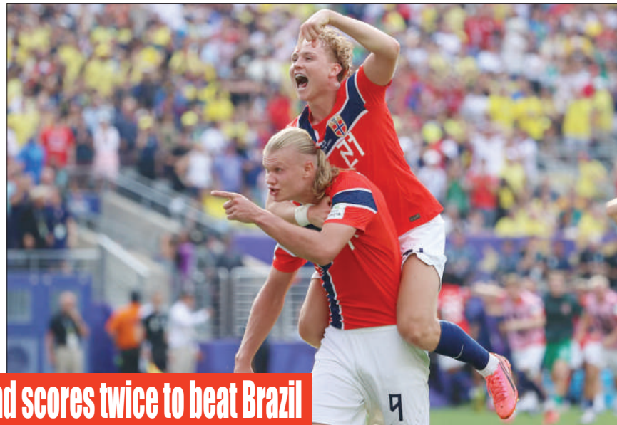
Erling Haaland scores twice to beat Brazil

"It felt it was a gift from God that it actu-