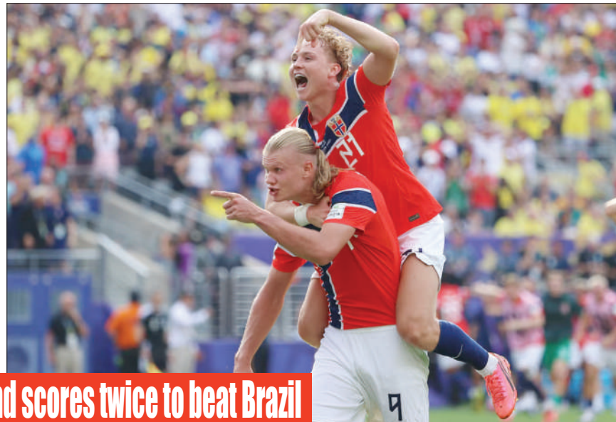
Erling Haaland scores twice to beat Brazil

"It felt it was a gift from God that it actu-