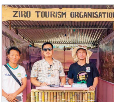
Hong Dree Festival as the chief guest.